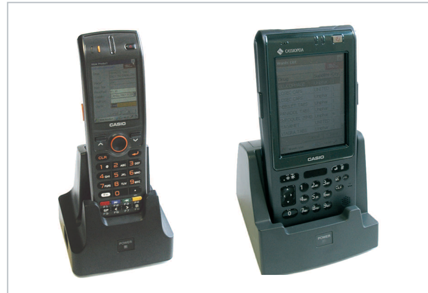
Wireless hand-held scanners can be used for order deliveries and adding to your wants list