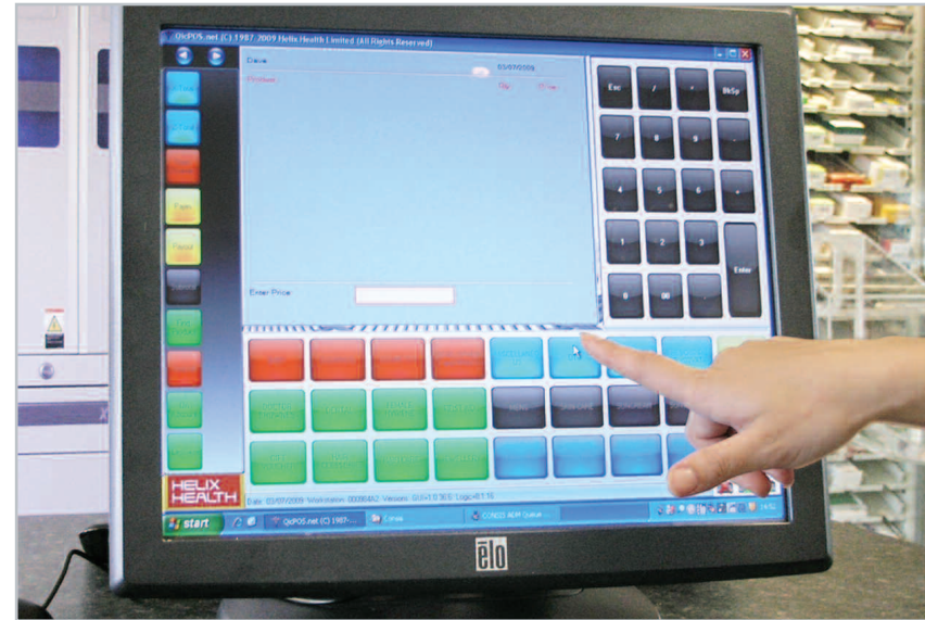
Touch screen technology for ease of use and speedy transactions